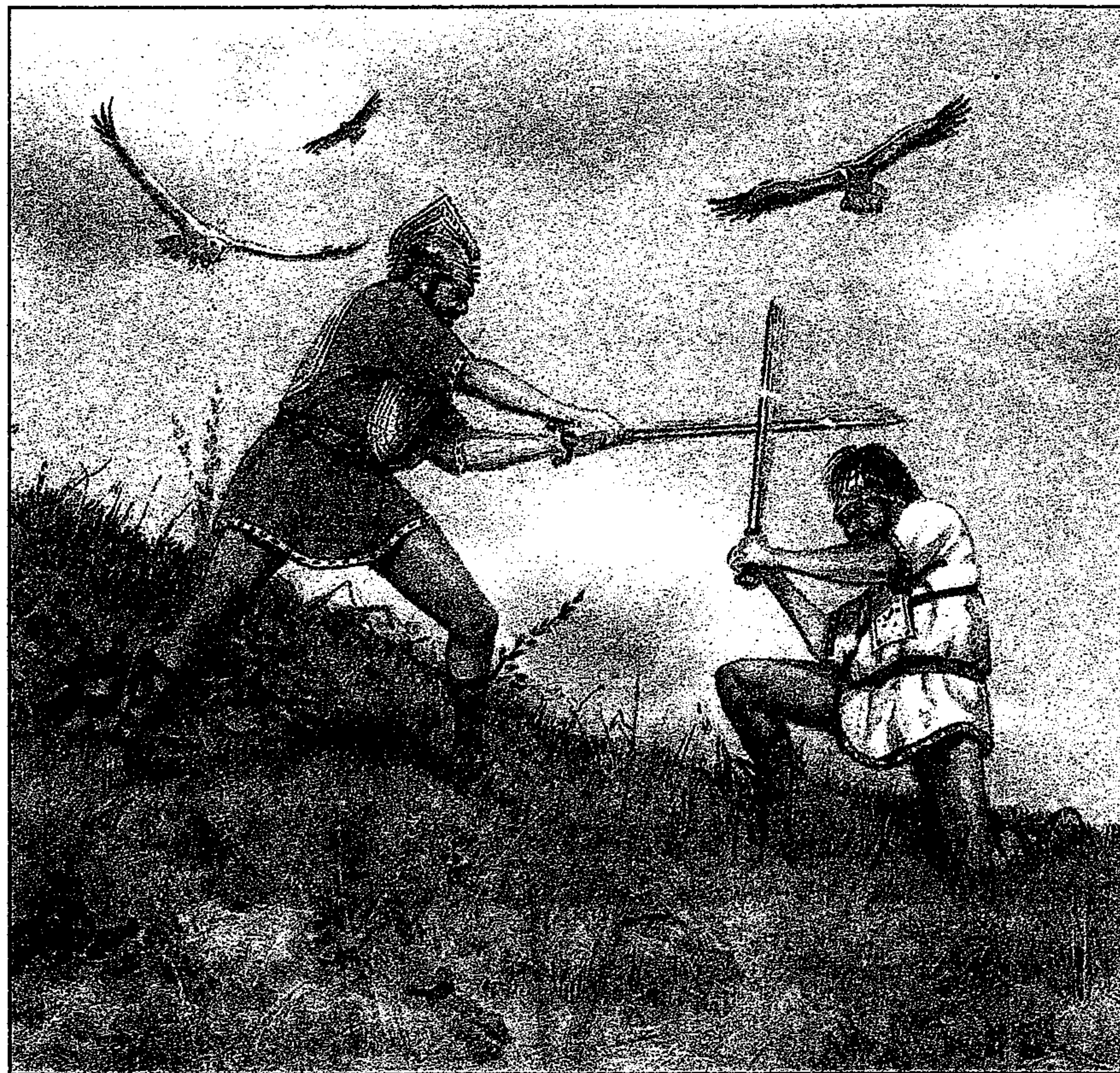
POWER STRUGGLE: Romulus and Remus fight for the right to be king.